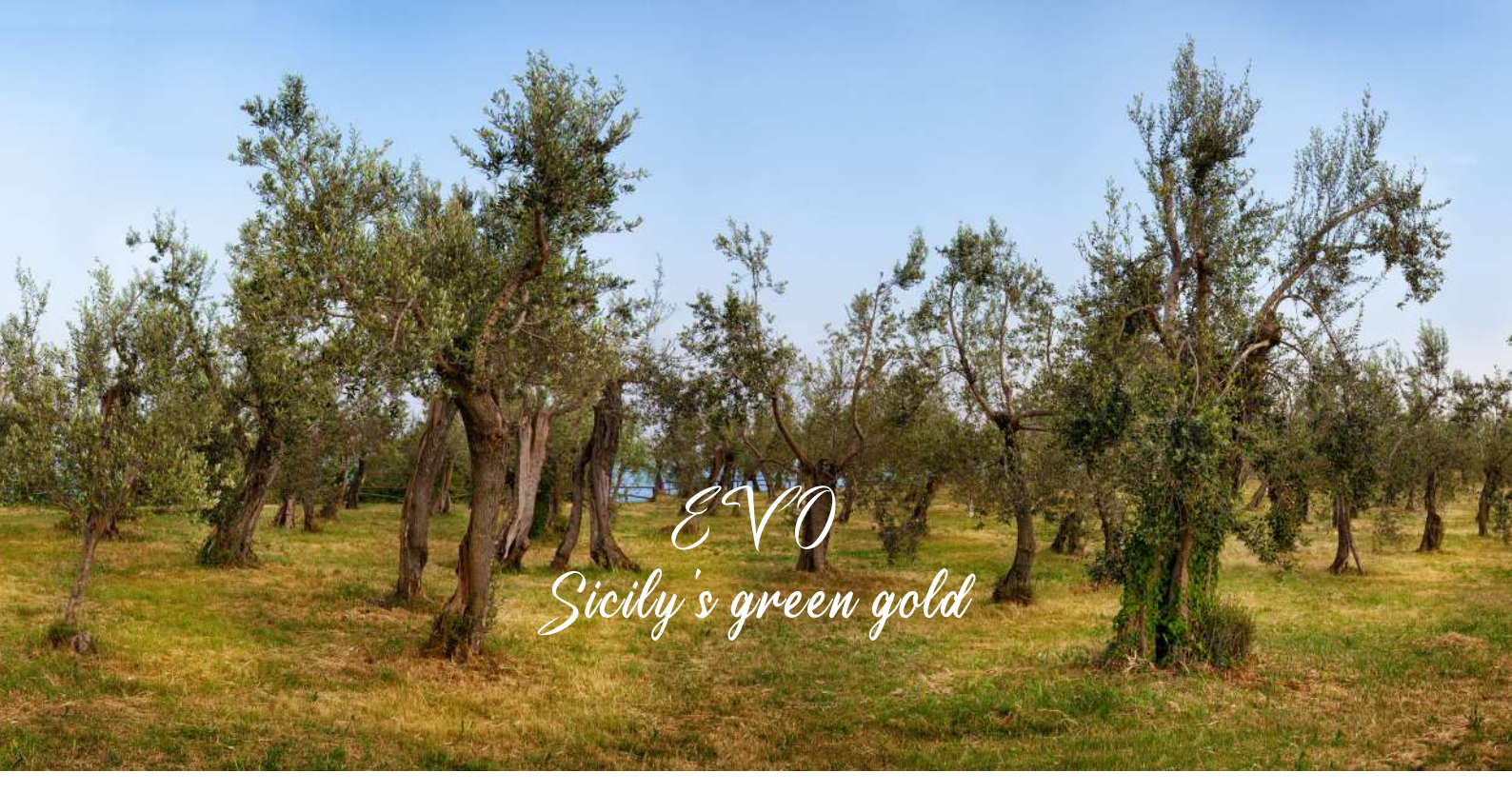
Evo 4 You! Discovering the oil mills of the territory

It is right here, between the sea and the hills that the "green gold" of Sicily is born: Extra virgin olive oil , heritage of the island's history, story of Syracuse's culture and territory. Excellence and indispensable ingredient to enrich the taste of all dishes of traditional Mediterranean cuisine.